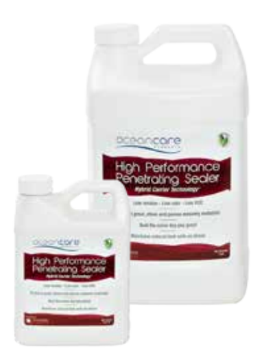
Available sizes / part number / coverage* Quart / OCG-50-0004 / 125-625 sq. ft. Gallon / OCG-50-0005 / 500-2500 sq. ft.

Penetrates and protects grout, natural stone and other porous masonry materials. Forms an invisible, no-sheen barrier that is resistant to water and oil and provides superior stain protection. Low residue formula is specifically designed to be easier and faster to apply than traditional penetrating sealers. May be applied to dry, damp, cured or uncured grout or natural stone (seriously...immediately after grouting!).