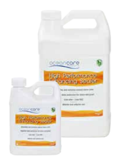
Available sizes / part number / coverage* Quart / OCG-37-4970 / 50-375 sq. ft. Gallon / OCG-37-4971 / 200-1500 sq. ft.

A low VOC, all-in-one color enhancer and penetrating sealer for both interior and exterior applications. Intensifies and enriches the color of natural stone, grout, concrete and other porous masonry materials. Forms a barrier that is resistant to water and oil and provides superior stain protection.