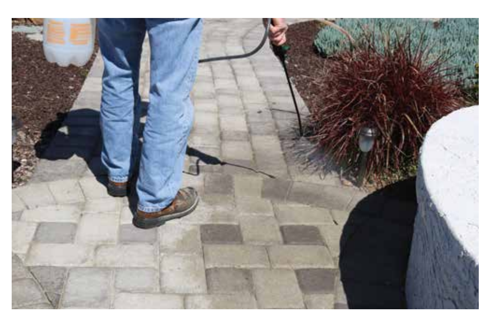
*Actual coverages may vary depending on surface texture, porosity and rate of application